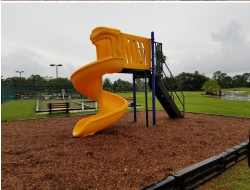
Kid approved by 9 am! Children have been enjoying it all day!